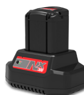
913686 - Lithium Battery