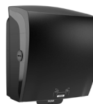
82070 Katrin Plastic Dispenser For System Paper Towel Roll, Black