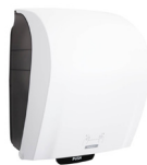
40735 Katrin Plastic Dispenser Extra Large For System Paper Towel Roll, White