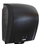
40711 Katrin Plastic Dispenser Extra Large For System Paper Towel Roll, Black

Selection from all countries. Please refer to web page for market-specific availability.