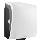
82094 Katrin Plastic Dispenser For System Paper Towel Roll, White