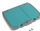
Double bottom lid for 120 L bag holder