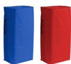
120 L plastified bag