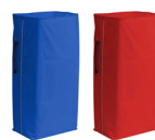
120 L plastified bag with zip