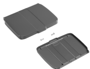
Lid 120 L bag holder with check-list holder