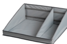
Divider Green Hotel