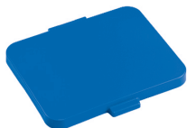
Lid for 120 L bag holder