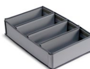
Divider Magic Hotel