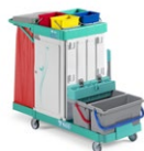
Magic Line 350S7