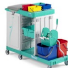
Magic Line 350P