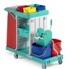
Magic Line 350B