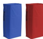
120 L plastified bag with zip