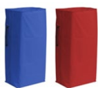
120 L plastified bag